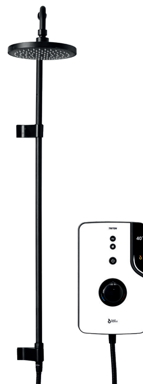
UNIQ® Kit Thermostatic Electric Shower GEEHRU81

*Savings are up to, when compared to an 8 l/min mixer shower connected to a WWHRS