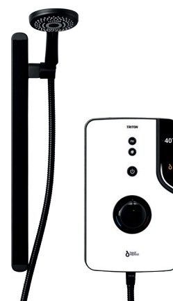
Back To Wall Kit Thermostatic Electric Shower GEEHRB81